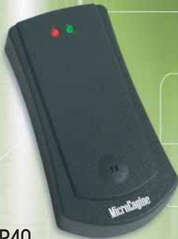
XP-SR40 - Standalone Proximity Access System