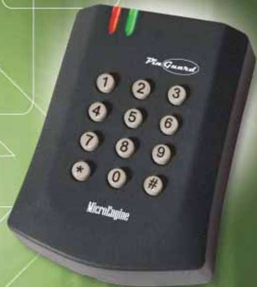
XP-SK32 - Standalone PIN Access System