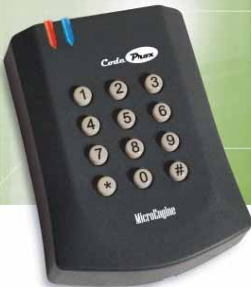
XP-SR200K-N - Standalone Proximity with Keypad Access System