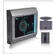
AR500U Long Range Reader