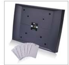
AR200U Mid Range Reader