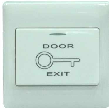
Model : DEB-33ABS